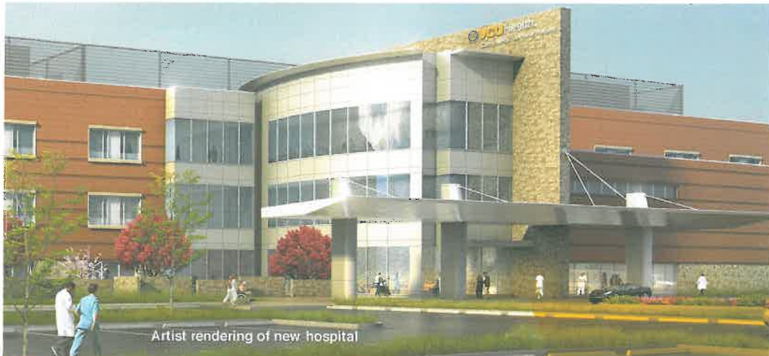
Artist rendering of new hospital